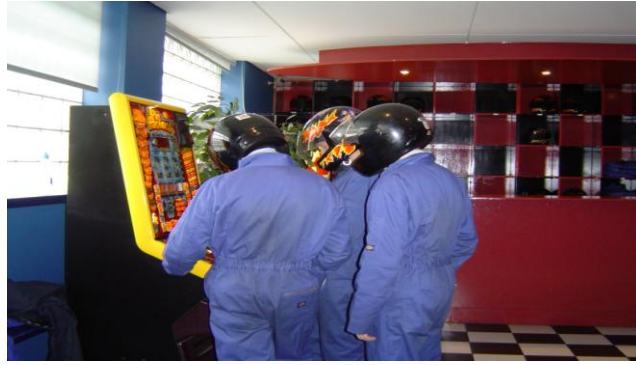
Team building session GO KARTING for young people attending Youth on the move project July 2009