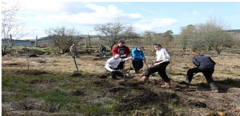
The First Squad from Future job Fund scheme start Nov 2009/Jan 2010. The scheme will develop a 3.5 acre site into a natural play area.