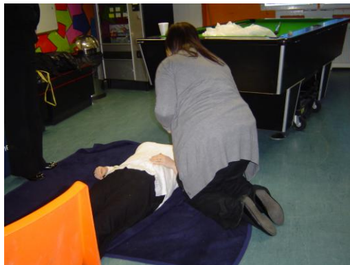
Training in the community and future job fund candidate learn First Aid June 2009 over 25 young people have completed and gained a three year certificate.