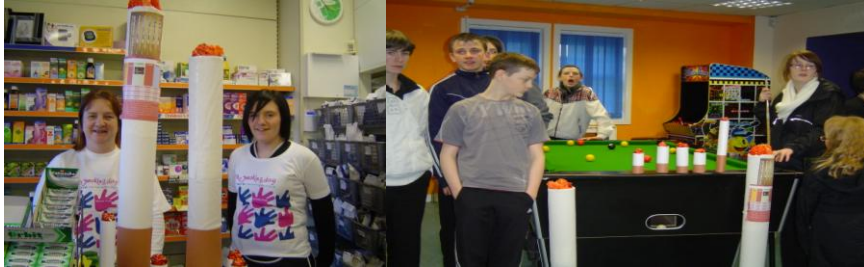
March 2009 young people participate in non smoking campaign within local community and made the props for shop windows.