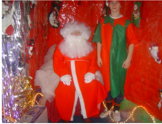
Young people build Santa grotto and participate in community Christmas fare 2009