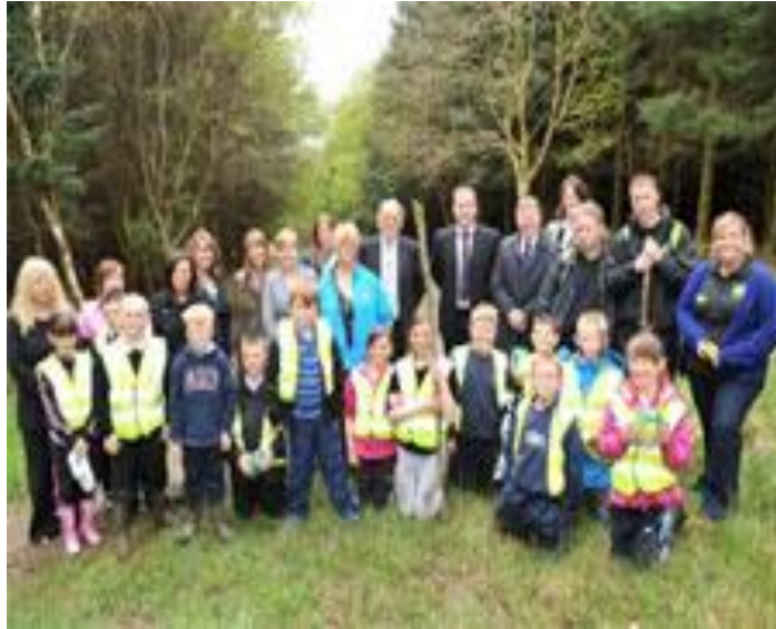
Ministerial visit May 2009 launch of mobile GO PLAY experience aim providing free play experiences to 4000 children aged 5-13 years Over 18 month period