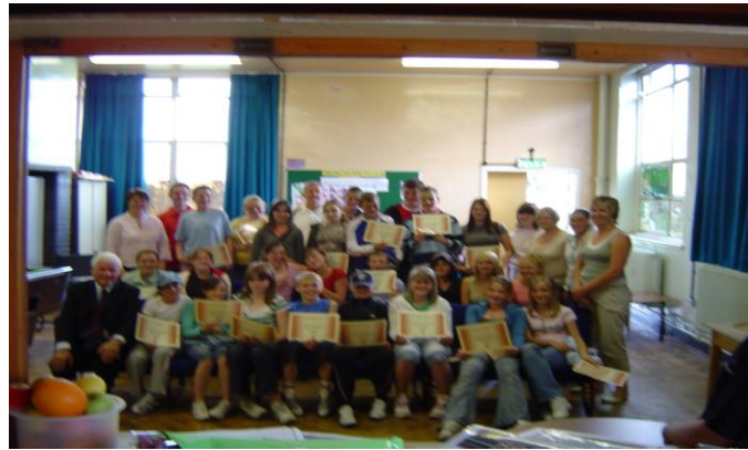
Young people receiving bronze silver and gold Youth achievement awards August 2009 through East Ayrshire council community learning and development team.