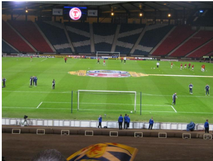
The Scotland friendly match at Hampden March 2010 twenty young people had the opportunity to attend.