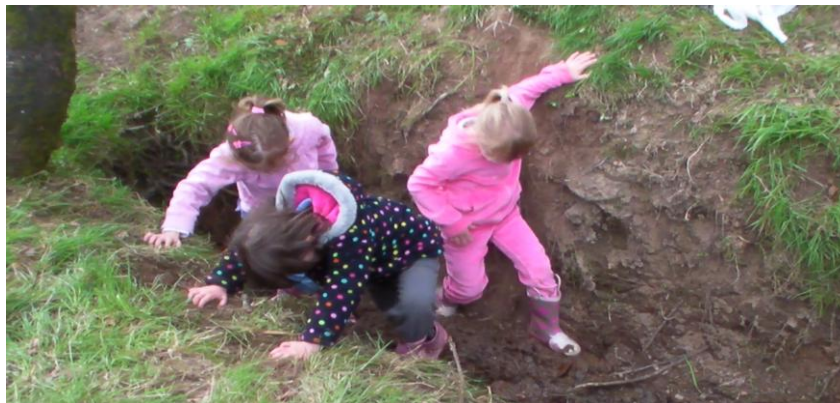
Children negotiating their way across a ditch in their local area.