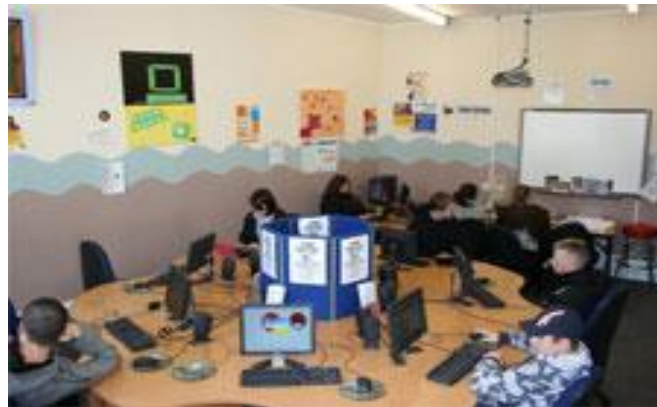
The "Youth on the move" embark on another session of social and vocational training April –June 80 young people successfully transported to positive destinations